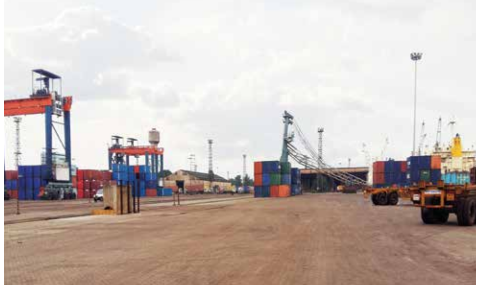
HALDIA INTERNATIONAL CONTAINER TERMINAL

In September, HICT handled the first full rake of 90 x 20's for Maersk Line on MV Soul of Luck, another vessel operated by Far Shipping. The laden rake was handled in a record time of 2 hrs in HICT with the great support of HDC officials and labour who were very experienced and ready to help. The rake ran from Vedanta to Jharsuguda (Odissa), 547 km from Haldia. It turned around and was reloaded with empty containers for a second run, which was handled as efficiently. This gives the trade a new efficient and viable option ■